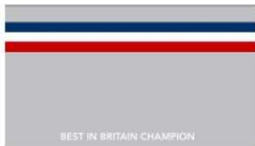
BEST IN BRITAIN CHAMPION