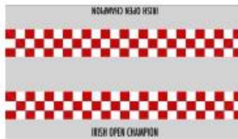
IRISH OPEN CHAMPION.