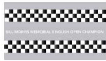
BILL MORRIS MEMORIAL ENGLISH OPEN CHAMPION